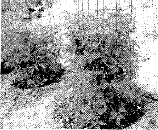
100 pounds tomatoes on one plant