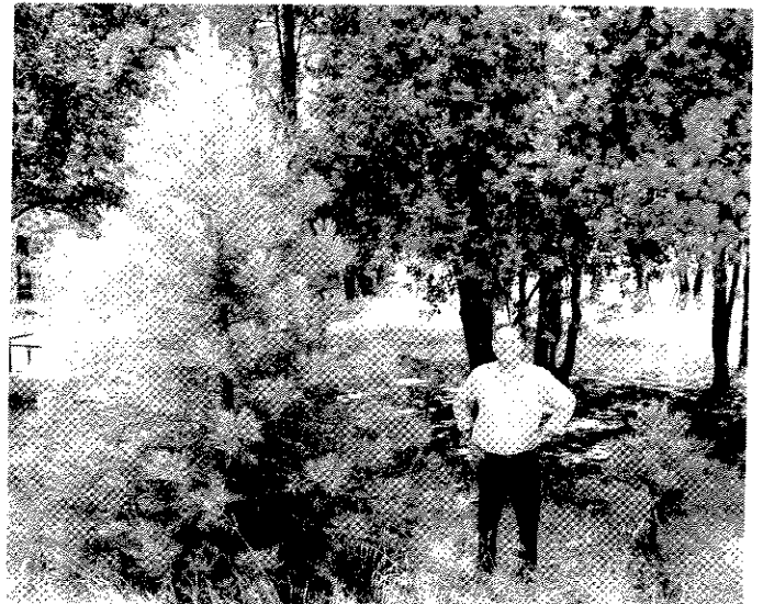
Tree on left planted Ellen White Method Tree on right planted forestry method